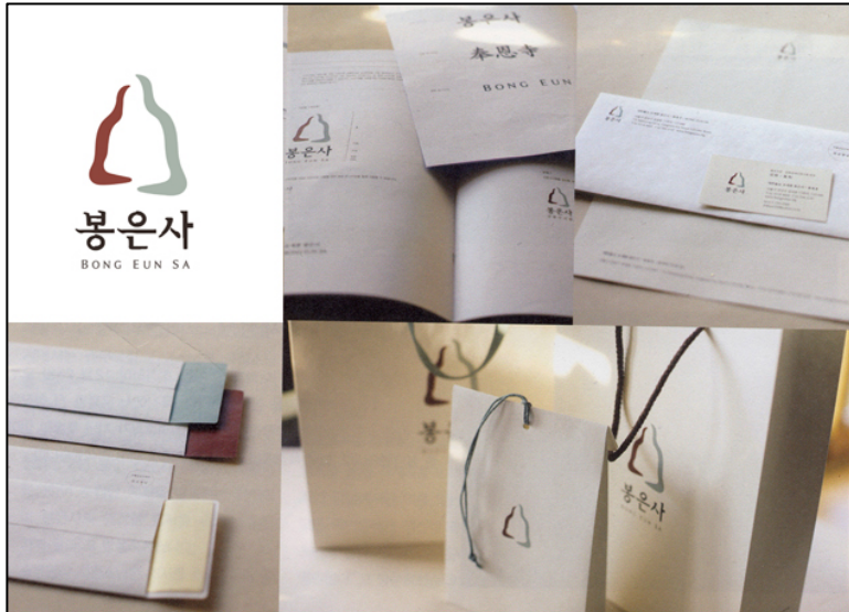
Figure 2. The new logo and examples of the graphic charter and signature established in Bongeunsa in 2008 (published on Bongeunsa’s website in 2008)

In addition to this rather systematized core of discourse, Bongeunsa used the services of a design studio (Studio BAF) outside the Buddhist world in order to establish graphics standards. As for many organizations and companies, this chart was aiming at creating a thoughtful and systematized visual identity that would be rolled out to various documents and objects used or produced by the temple. This graphic system, named (directly in English) “T.I.” (Temple Identity) entails a new logo as well as a specific font and three colors listed in the international system CMYK (Cyan, Magenta, Yellow, Key Black). As stated by the artistic director of the BAF Studio, Rhee Nami, the realization of the logo and the particular attention to shapes and colors have been conducted consistently with the values and perspectives of Bongeunsa, “by combining the western language of shapes named ‘design’ with Buddhism.” The intent was to facilitate communication with both a Korean and international audience: